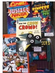
New graphic novels